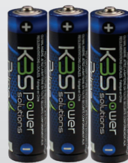
3 AA KBS Power Solutions Prime Alkaline Cells Included